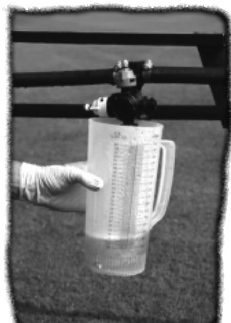
Measure the output from each nozzle for 1 minute.

For more information, see the Web site at http://aggieturf.tamu.edu .